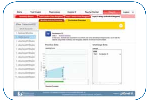
Quick access to exportable and printable reports that cover all aspects of student progress.

Students have the option of having each question read aloud to them.